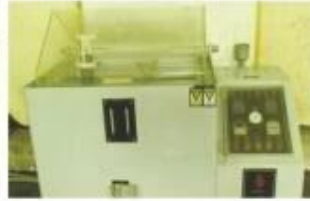
盐雾测试设备 Salt-spray Tester