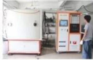
真空镀膜机 Vacuum coating machine