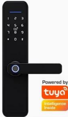
X3 graffiti version

Designed for different demand scenarios, better management