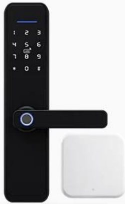
X3 all-lock screen version

Designed for different demand scenarios, better management