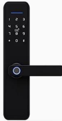
X3 tongtong lock plate