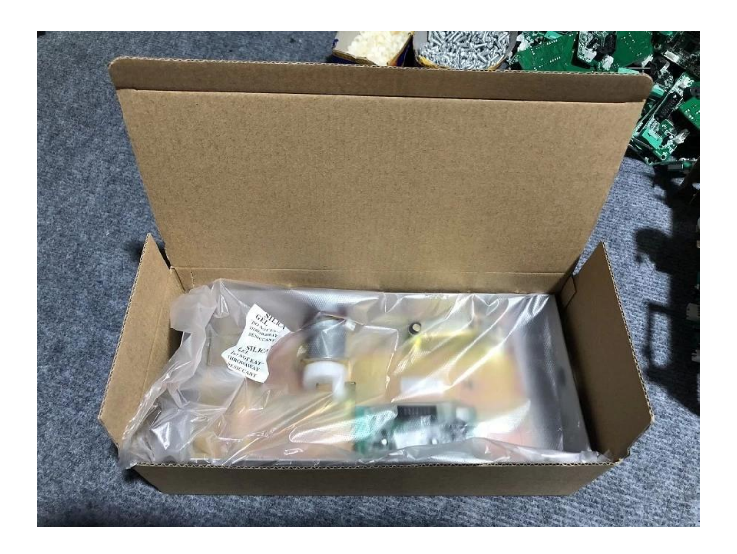
electronic code hotel safe keypad lock with mechanism factory China