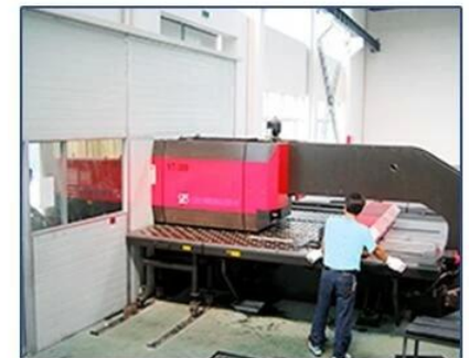
VT300 Punch Machine