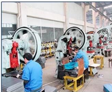
Rope Pull Force