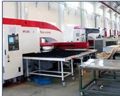
CNC Punching Machine