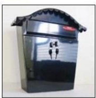
digital lock safe box factory China

We manufacture safe and lock since 2004.Our safes range is hotel safe,home safe,office safe,commercial safe,gun safe,key cabinet,cash safe,cash drawer etc.More than 95% of our models are exported to more than thirty countries.Besides we also make smart locks such as hotel key card lock,fingerprint lock,password lock,glass door lock,cabinet locker lock etc.Welcome to visit our facilty at any time.