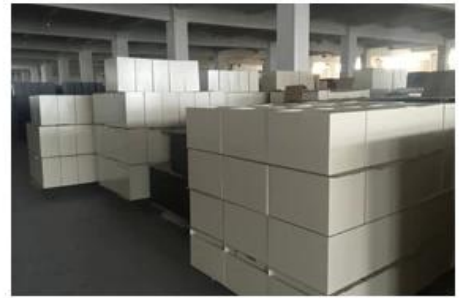
Product sample room