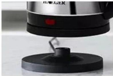
360 degree rotational base