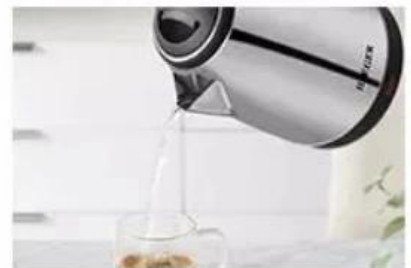
Precise pouring control