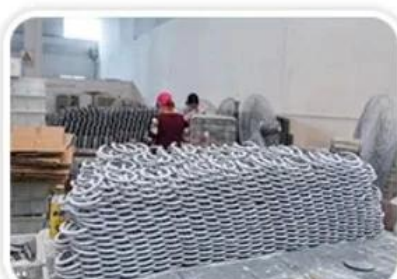
Semi-Finished Heating Tube