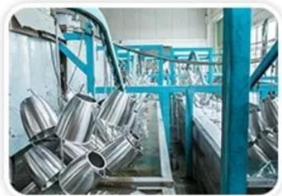
Ultrasonic Wave Cleaning