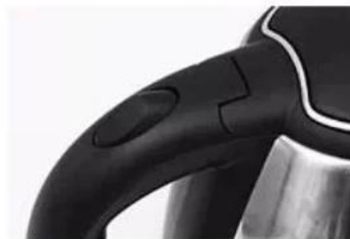
One key control