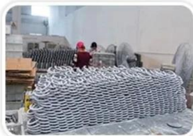
Semi-Finished Heating Tube