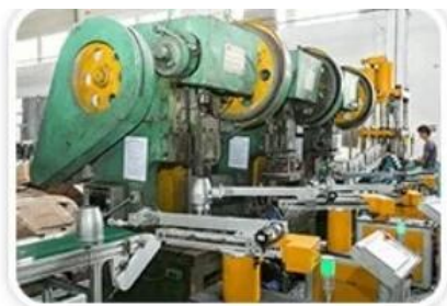
Hardware Stretching and tinseling