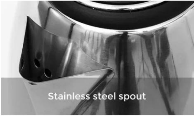
Stainless steel spout