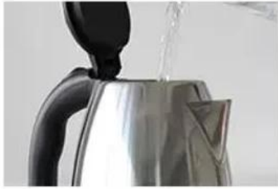
The large capacity of 2.0L