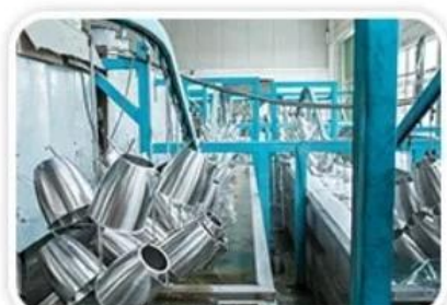
Ultrasonic Wave Cleaning