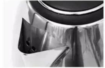
stainless steel spout