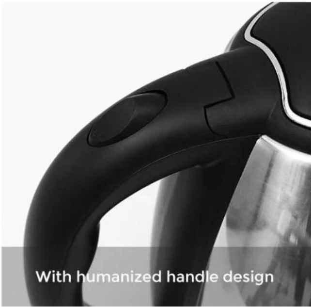
With humanized handle design