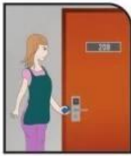
服务员清洁房间 Cleaning Rooms