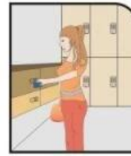
使用智能箱存放物品 Use of Cabinet Locks