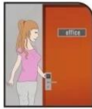
刷卡进入客房 Enter to the Rooms