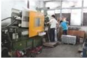
锌合金压铸机 Zinc alloy die casting machine

We deliver the excellent products to all of our customers with our advanced equipment.