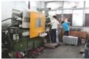
锌合金压铸机 Zinc alloy die casting machine

We deliver the excellent products to all of our customers with our advanced equipment.