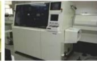
主板贴片机 The motherboard Chip mounter