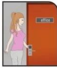
刷卡进入客房 Enter to the Rooms