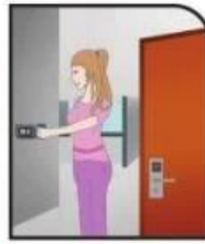
插卡取电 Insert card to gain power