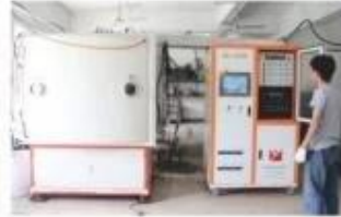
真空镀膜机 Vacuum coating machine