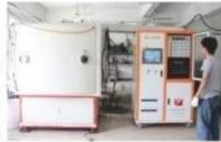
真空镀膜机 Vacuum coating machine