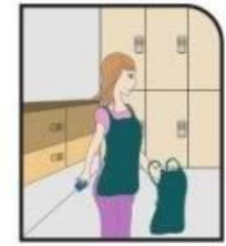
员工更换工作服 Use of Cabinet Locks

We deliver the excellent products to all of our customers with our advanced equipment.