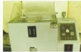
盐雾测试设备 Salt-spray Tester