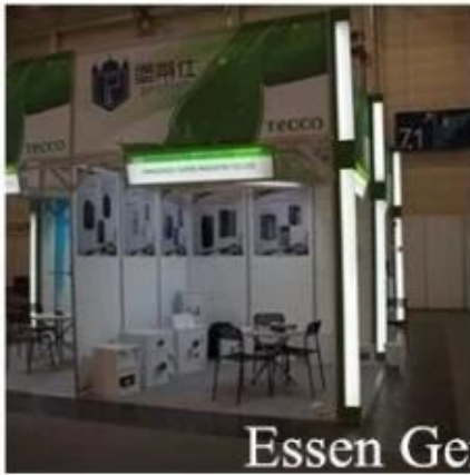
Essen Germany 2016