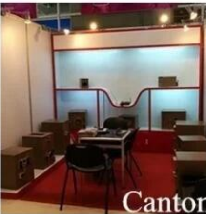
Canton Fair 2016