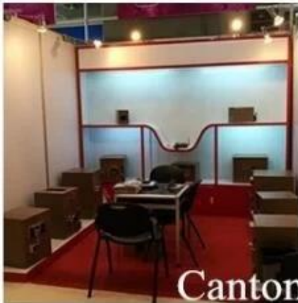
Canton Fair 2016