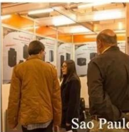
Sao Paulo Security Exhibition 2015