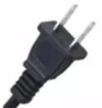
Two flat pins plug