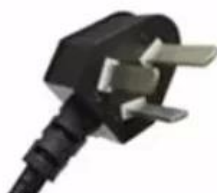
Three flat pins plug