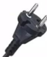
Two round pins plug