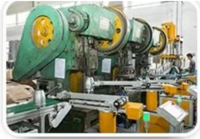
Hardware Stretching and tinseling