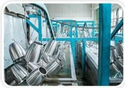
Ultrasonic Wave Cleaning