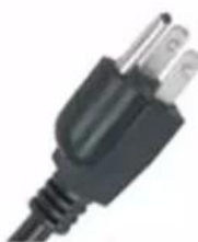
Three pins plug