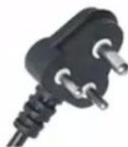
South africa plug