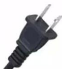
Two flat pins plug with polar