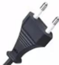
Two round pins plug A