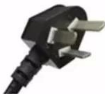
Three flat pins plug