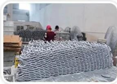
Semi-Finished Heating Tube