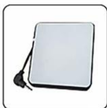
External power supply