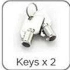
Keys x 2