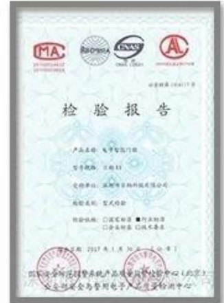
Quality inspection report