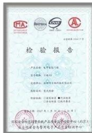
Quality inspection report