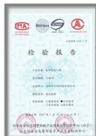
Quality inspection report