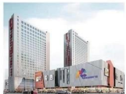
大庆摩玛休闲广场