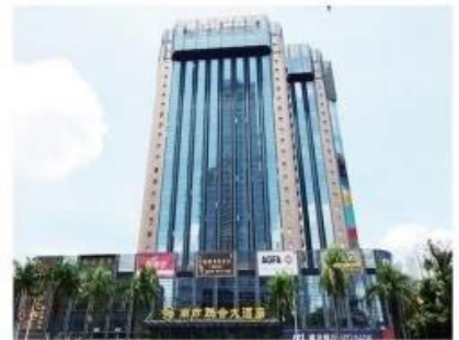
深圳南方联合大酒店