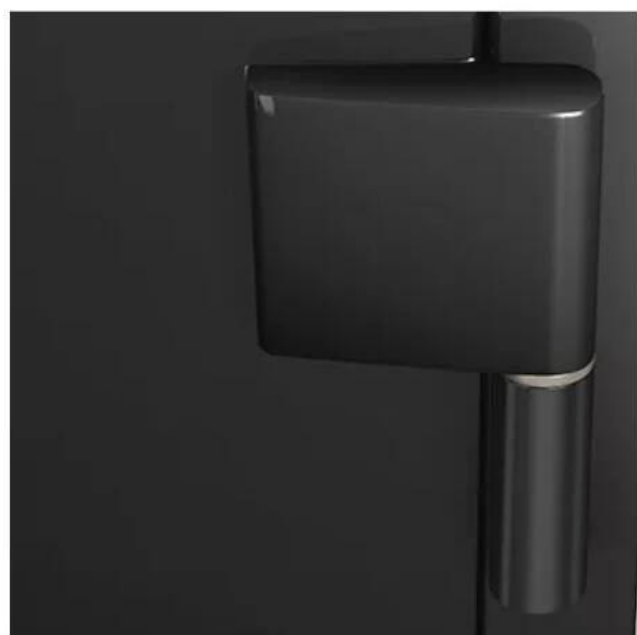
Reinforced Hinge, security upgrade