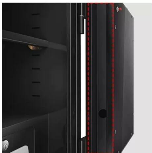
Door frame groove design, anti-prying upgrade